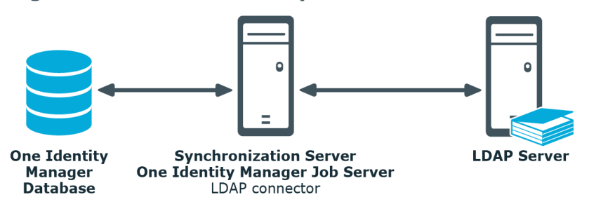
Figure 1: Architecture for synchronization

The LDAP connector is used for synchronization and provisioning LDAP. The LDAP connector communicates directly with an LDAP server.