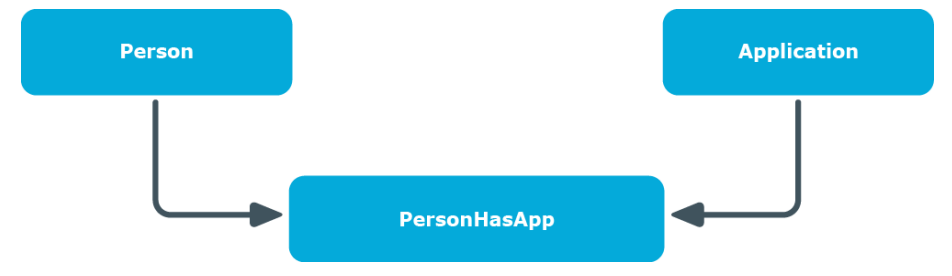
Figure 1: Inheritance with direct assignment of software to employees

Assignments of roles to software are stored in the <BaseTree>HasApp table. Software can also be inherited through system roles. For more information, see the One Identity Manager System Roles Administration Guide .